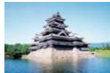
Matsumoto Castle (Matsumoto City)