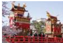
Takayama Festival (Takayama city, Gifu Prefecture)

Shiojiri City Industrial Promotion Division Brand and Tourism Section Tel: 0263-52-0886; http://www.city.shiojiri.lg.jp/ Shiojiri-Kiso Film Commission Tel: 0264-34-1122; http://www.filmcommission.jp/