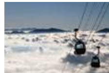
Ontake Ropeway (Kiso Town)