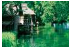
Daiou Wasabi Farm (Azumino City)