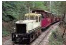
Akazawa natural recreation forest (Agematsu Town)