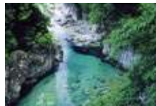
Atera Valley (Ookuwa Village)