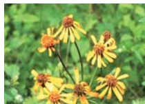
Glabrifolius (cufod) Kitam