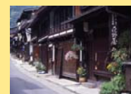
Post town "Naraijuku"